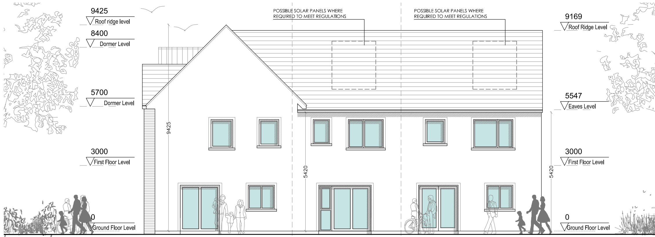
Proposed Back Elevation SCALE 1:100 @ A3

HOUSE TYPE 10C.1 4 BED RIGHT END TERRACE HOUSE TYPE 6 2 BED MID TERRACE HOUSE TYPE 7B 3 BED LEFT END TERRACE